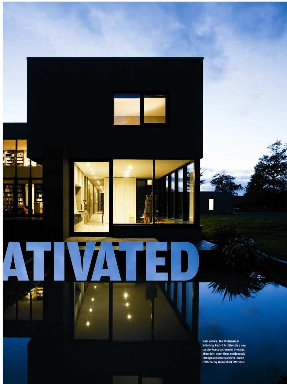
Main picture: The Wilderness in Suffolk by Paul+O Architects is a new country house surrounded by water. Above left: water flows continuously through and around a north London residence by Munkenbeck+Marshall.